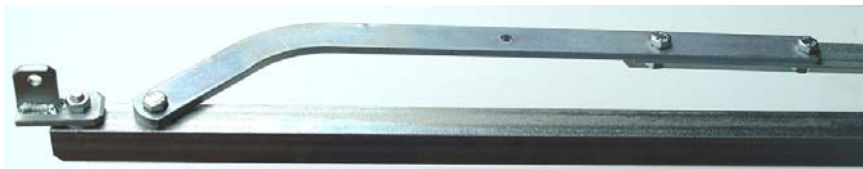
Arms shown configured for RH leaf to close first (when viewed from inside)