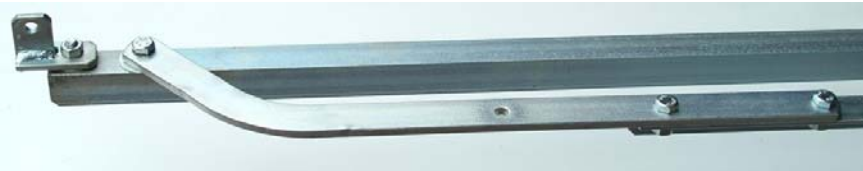
Arms shown configured for LH leaf to close first (when viewed from inside)