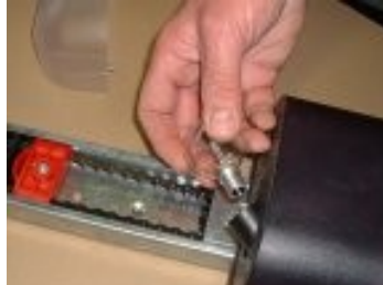
2. Remove bulb.