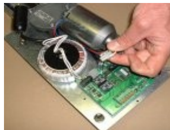
8. Remove wire from motor.