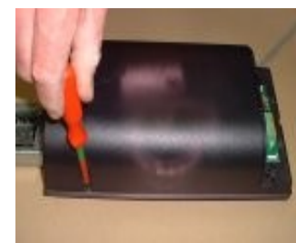
6. Remove retaining screws (x3).