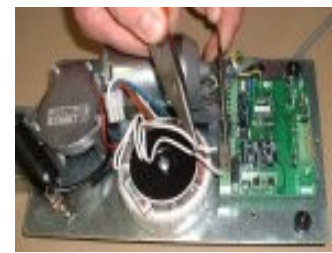
9. Carefully noting position of remaining wires – press orange tabs down and remove wiring from terminal blocks.