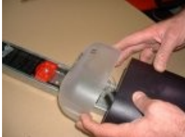
1. Remove diffuser cover.

Tools required. Long nosed pliers, a flat bladed and a Phillips type screwdriver.