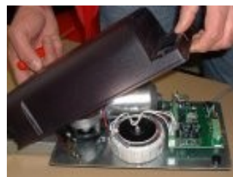
7. Remove cover.