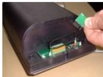
4. Remove Receiver card.