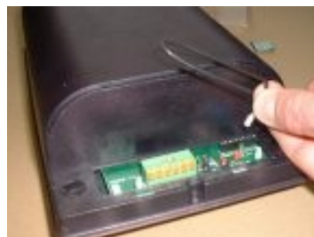
5. Remove antennae wire