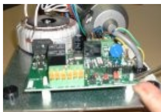
10. Using flat blade screwdriver, press barb on PCB spacer to compress it, at the same time lift the PCB gently up to remove it from spacers (x4.)

11. Place new PCB on to spacers and press down gently but firmly until PCB "clicks" into place.